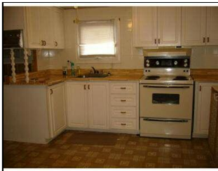
58 Vanier Kitchen View