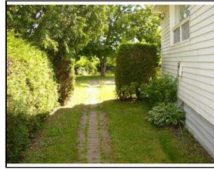
58 Vanier Side View