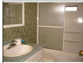
58 Vanier Bathroom View