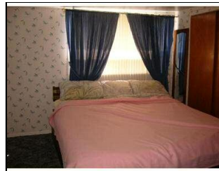
58 Vanier Master View