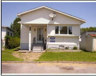
58 Vanier Front View

Phone: 613-283-6666 Cell: 613-284-7000 Fax: 613-283-9063 Email: yourhome@leehitchins.com Website: leehitchins.point2agent.com