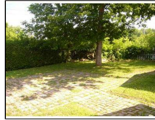
58 Vanier Yard View