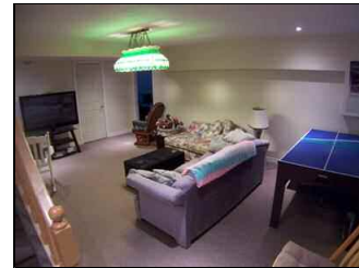
LOWER REC ROOM