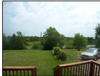
FRONT DECK VIEW