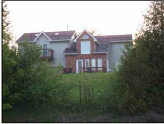
FRONT VIEW FROM HWY29

Phone: 613-283-6666 Cell: 613-284-7000 Fax: 613-283-9063 Email: yourhome@leehitchins.com Website: leehitchins.point2agent.com