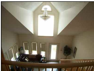
FAMILY ROOM VIEW