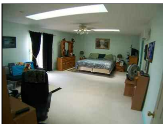
MASTER WITH SKYLIGHTS