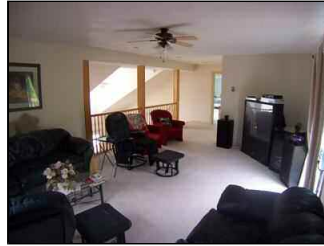
UPPER FAMILY ROOM