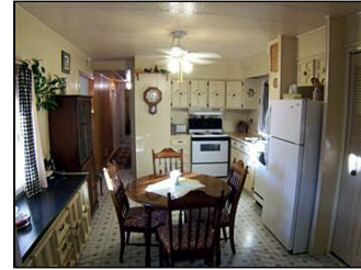
22 TRACY KITCHEN