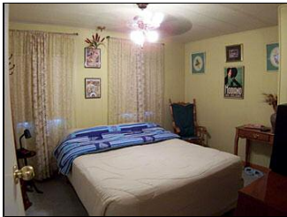
22 TRACY MASTER