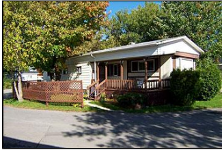
22 TRACY FRONT VIEW