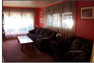
22 TRACY LIVING ROOM