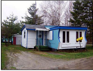
FRONT VIEW OF HOME

Phone: 613-283-6666 Cell: 613-284-7000 Fax: 613-283-9063 Email: yourhome@leehitchins.com Website: leehitchins.point2agent.com